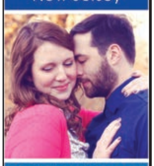
CatholicMatch.com/ date NJ