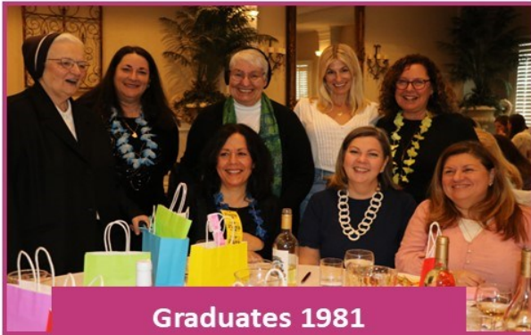
Graduates 1981 43 Years Ago First Fashion Show

The Fashion Show and Auction were a great success. Thank you to our alumni who supported the new graduates!