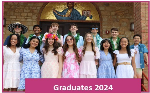
Graduates 2024 Will see you in 2067! 86th Fashion Show!